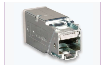
Z-MAX Shielded Panel Outlet