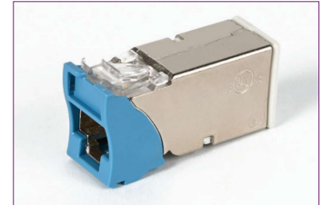
Z-MAX Shielded Hybrid – No Door Outlet

Is compliant with UL2043 and is appropriate for use in air handling spaces.