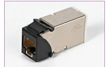
Z-MAX Shielded Keystone Outlet