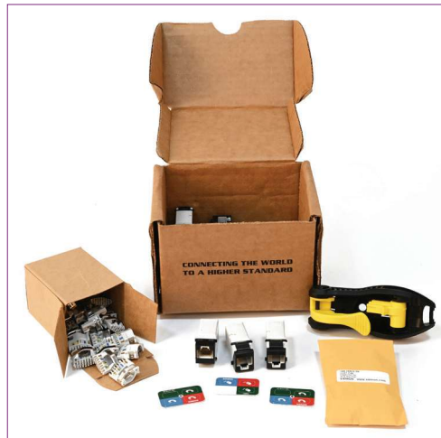
24-Count Bulk Pack shown for reference.

Back 1 Red Voice 1 Blue Voice 1 Bezel Color-Matching Voice 1 Bezel Color-Matching Blank